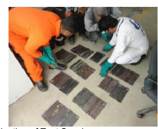
Accurate and Helpful Evaluation of Test Specimens