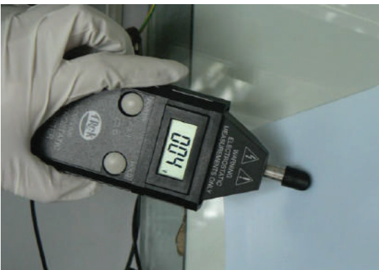
ESD Test (HBM, MM, Latch Up)