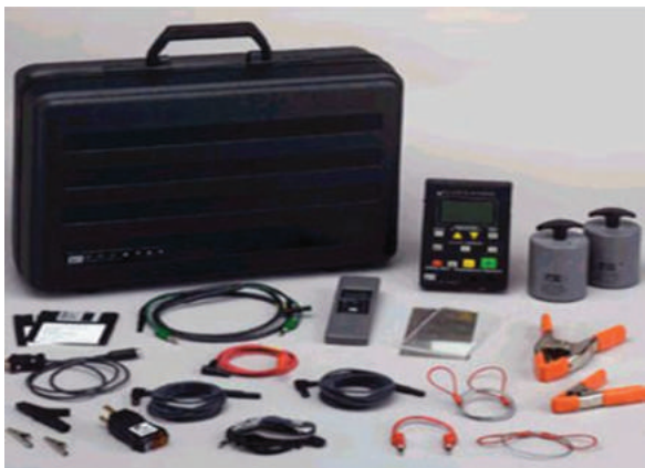
Surface & Volume Resistance Testing