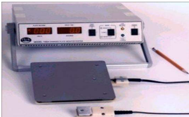
Charged Plate Monitor